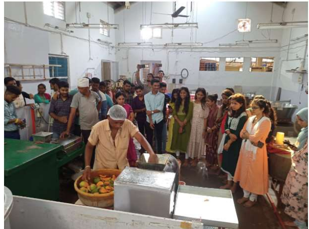
Industrial tour to Dwarka industry Zante's industry in Sindhudurg district