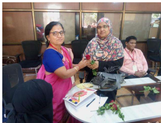
Parents meeting were organised of the students of F. Y., S. Y. and T.Y.