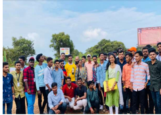
Industrial Tour- Kaspathar, AjinkyaTara, Sajjangad, Talbeed, Karad etc.