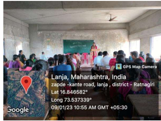
Bindhast bol Competition