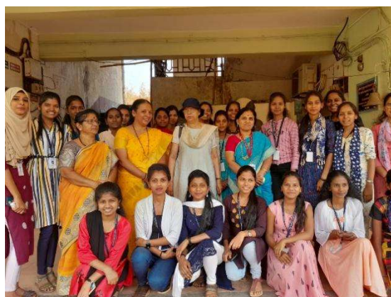
Entrepreneurial skills development workshop - Theme – Snacks In association with Swyamsidha Sanstha, Kolhapur Sponsored by G. F. Piping System Pvt. Ltd. Ratnagiri